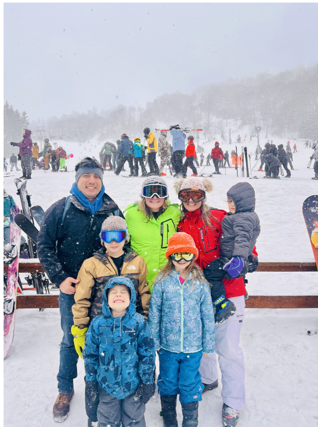
Figure 1: My Family