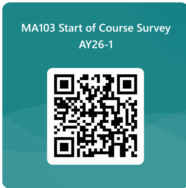
Figure 1: Course Survey